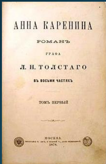
Cover page of the first volume of Anna Karenina . Moscow, 1878.